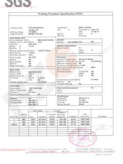
Hengzheng Copper Ltd

Jinyuan Mansion C, 507, 38#Taiyuan RoadLuoyang City, C 471003 China