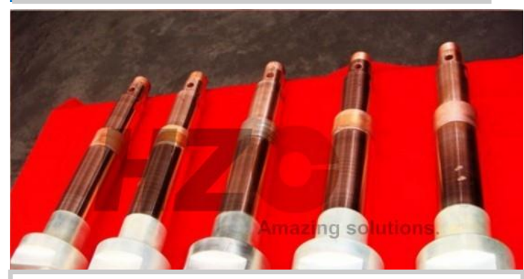
Polycrystalline silicon reduction water cooling furnace electrode