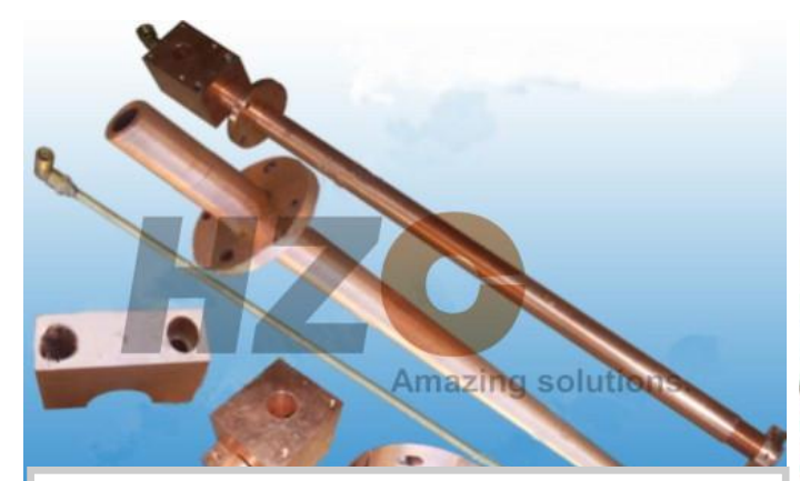
Monocrystalline and polycrystalline silicon copper electrode elements