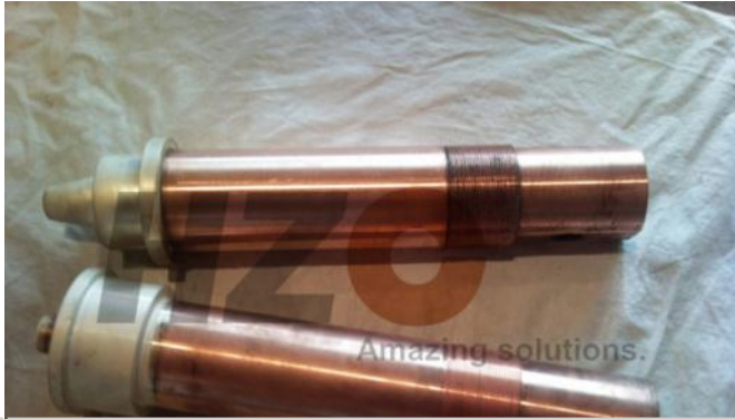
Polycrystalline silicon Hydrogenated furnace water cooling electrode